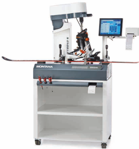
JETBOND SK OPTIONAL BASE FRAME