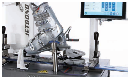
FULLY AUTOMATIC LATCHING