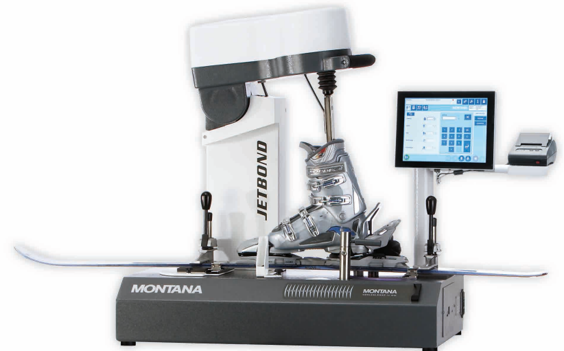
JETBOND ST STANDARD VERSION