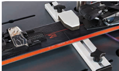
SPECIAL FIXATION FOR TOURING BINDINGS