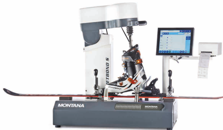
JETBOND TYP SK