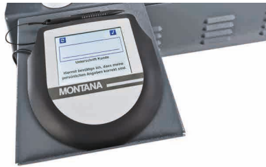
SIGNATURES PAD COLOUR