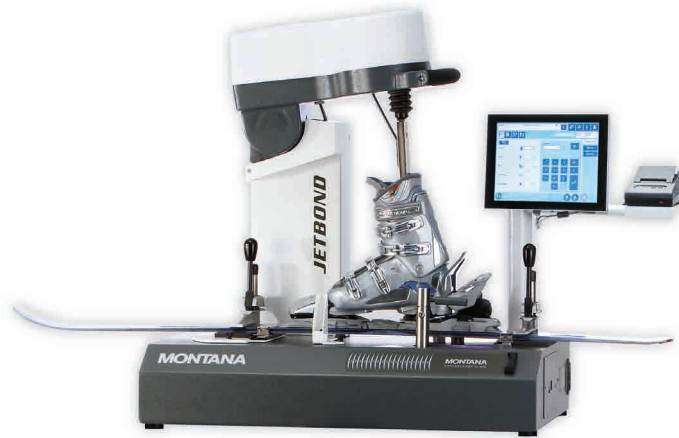
JETBOND TYP ST