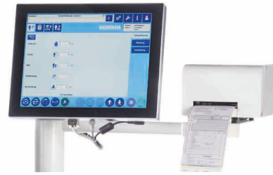
TOUCH SCREEN WITH NEW OPERATOR GUIDANCE & CARD-READER